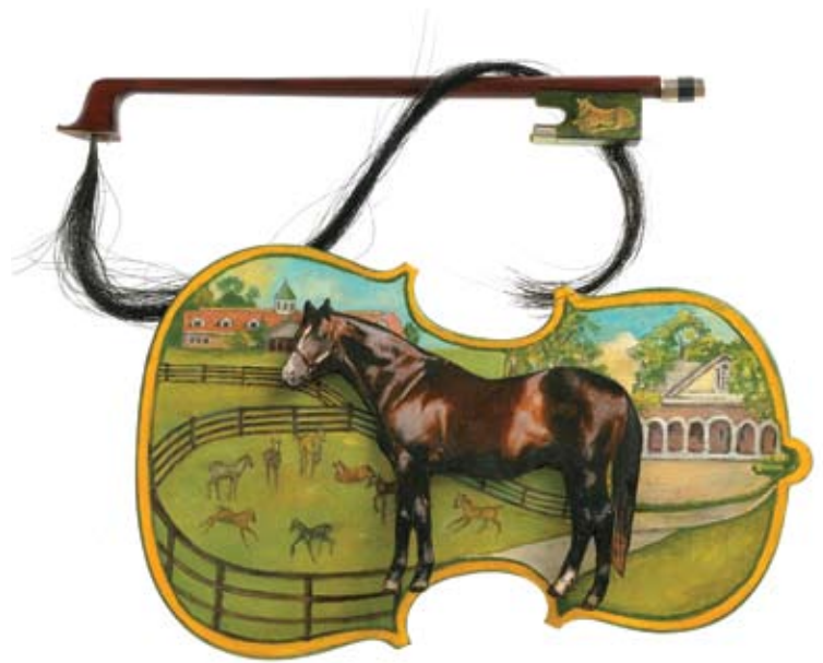
A.P. Indy Toss Chandler

Horsetails Celebrates Horses, Classical Music, and Visual Arts