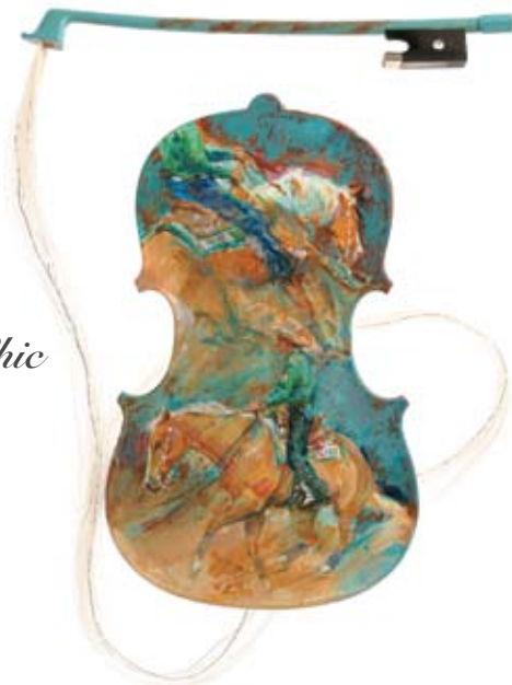
Wimpys Little Chic Sandra Oppgard